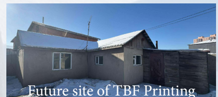
Future site of TBF Printing Resource Center

“For which of you, intending to build a tower, sitteth not down first, and counteth the cost, whether he have sufficient to finish it?”