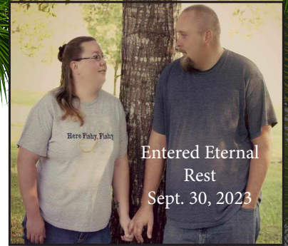
Entered Eternal Rest Sept. 30, 2023