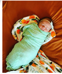
A bundle of Joy