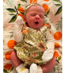
First Sunday School