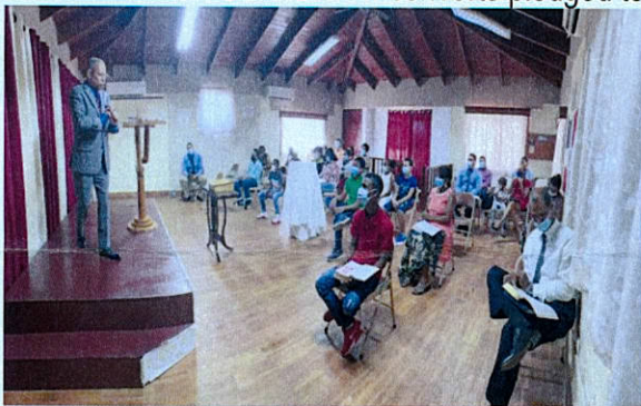
Our annual Missionary Conference

Thirty people received the Lord as their Saviour during the conference! The Lord greatly glorified Himself, and the Holy Spirit manifested His power through the preaching of the Gospel. The brethren prayed and worked hard to bring visitors, and God blessed our efforts. Several new converts pledged to support our missionary program.