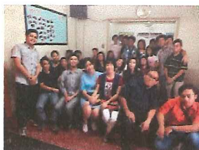
Last church service before the lockdown

Note: Starting May 1 st , our home church, Rock Springs Baptist Church (PO Box 367 Morrow, GA 30260) will process our support. Please make checks payable to RSBC and designate Woodley Ministry Philippines. Thank you!