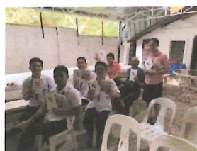
Literatures from BEAMS given to our staff and students