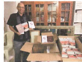
Bibles, tracts and Literatures from BEAMS