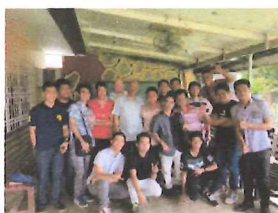
Picture taking with the men of CBC