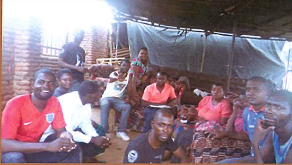
R: The Malawi Bible study keeps growing. One more soul was saved last Friday. Praise the Lord! We are so excited about the future of the ministry!