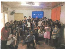
Picture taking with our Church family

Evangelism Church Planting Training National Pastors Deaf School & Church Bible Institute Property and Building