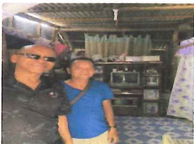
Home of the Bognot Family