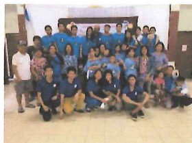
Foundation Day Celebration at CBDA