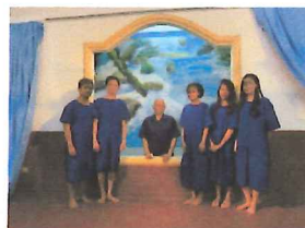
Baptism of five converts