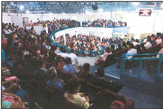
San Luis Potosi, Mexico

Is not the Lord worthy of P R A I S E?! He is amazing! Fires of Evangelism had three conferences in August. The first was in San Luis Potosi, Mexico. Over 3000 were in attendance, 240 pastors came, 35 souls received Christ as Savior during the week, and 92 brethren surrendered their lives to serve the Lord in full-time service! Most of