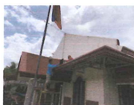
Renovation and repairs of our school building