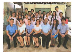
First day of our school