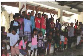
Picture of our ministry with the Aetas. Raised hands for salvation