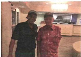
Picture with a WWII Veteran stationed at Pearl Harbor