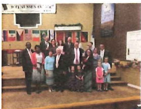
Missions Conference at Sheridan Road Baptist Church