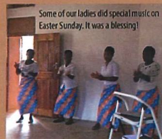
Some of our ladies did special music on Easter Sunday. It was a blessing!

As always, we thank you for your faithful prayers and support. We consider it a privilege and honor to partner with you in the work here in Zambia among the Deaf. May God richly bless you!