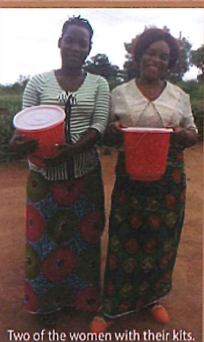
Two of the women with their kits.