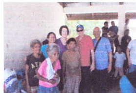
Group pictures with the Aetas