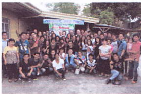
Celebrating Church Anniversary

Evangelism Church Planting Training National Pastors Deaf School & Church Bible Institute