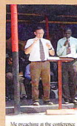
Me preaching at the conference