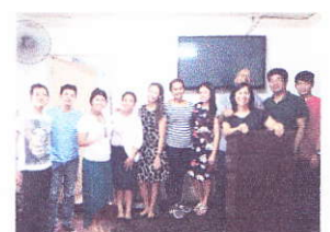
Picture taking with the staff