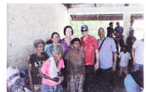
Ministry to the Actas, an Indigenous people group