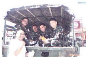
Tract Distribution in Bamban, Tarlac

Wishing you a Merry Christmas and a Happy New Year