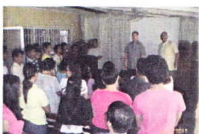
Individuals committing themselves to service