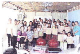
Cornerstone Baptist Deaf Academy