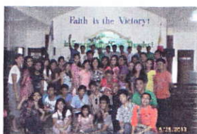
Our church families bringing in people to church