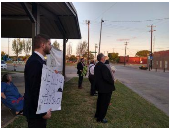
2 Participating in street preaching and singing in TX

Well, after all that time spent traveling in October, we are glad to be back home in Georgia. God has blessed us with another full month, with 15 churches on our schedule, but we are also glad that our travels will not take us so far from home in November.