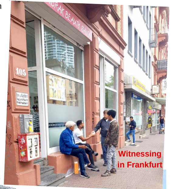
Witnessing in Frankfurt