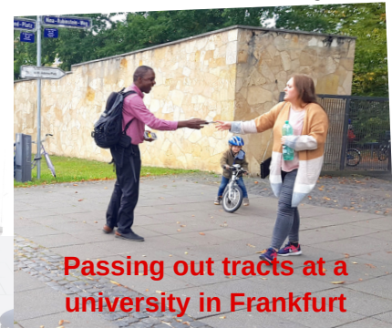
Passing out tracts at a university in Frankfurt

GEMS (Global Evangelism Ministry Services) is a ministry out of Calvary Baptist Church, 3812 Kirby Parkway, Memphis, TN 38115-5288. These ministry updates are published at least four times a year and may be requested at no cost by mailing to the above address or by going to our website at http://www.gems4christ.com